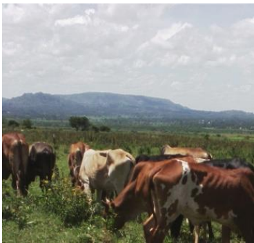
5yrs old SEAZ grazing