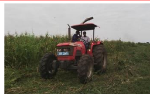
Maize silage, a diet supplement