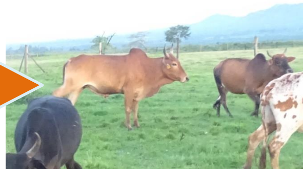
Desired LW and BCS for SEAZ at 2yrs